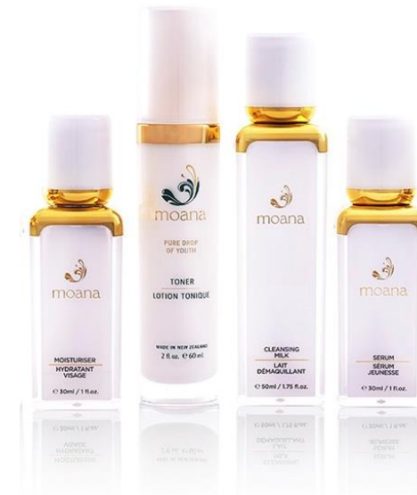
Moana women's series.

A natural, certified organic skincare brand from New Zealand.