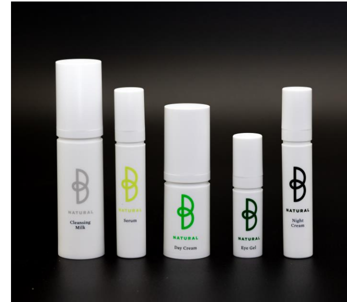
B Natural series both in travel pack size and traditional size.