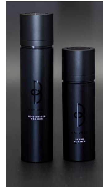
B Natural men's series.