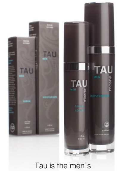
Tau is the men's Moana series.