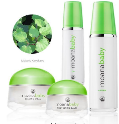
Moana baby series.