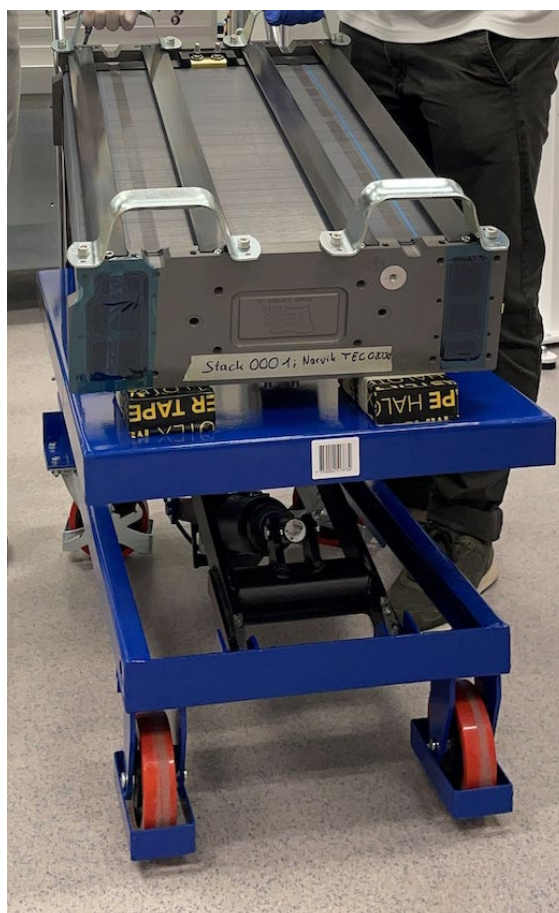
Stack0001Narvik: The first ever TECO 2030 fuel cell stack built in Narvik.

(Narvik, Norway, May 15th 2023) TECO 2030 (OSE: TECO, OTCQX: TECFF, ISIN: NO0010887516) completes first manual fuel cell stack production in Narvik. The TECO 2030 Fuel Cell stack is a 100kW Proton Exchange Membrane (PEM) fuel cell stack purposely developed for marine, heavy duty, stationary or mobile power applications.